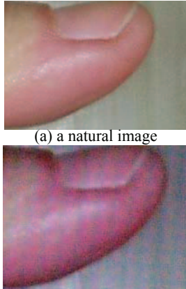
Fig. 2 Comparison of a Natural Image and its Casually Recaptured Version on a LCD Screen

differentiate a recaptured photo and a natural photo. In this paper, we consider identification of finely recaptured photos on common LCD screens. Since image recapturing is commonly accompanied with some image quality losses, we first study the settings for recapturing good-quality images. A perceptual study is then designed to test the human ability in identification of our finely recaptured images. Based on our observation, we further propose several sets of image features, including texture features, loss-of-detail features and color features to identify the recaptured images from natural images.