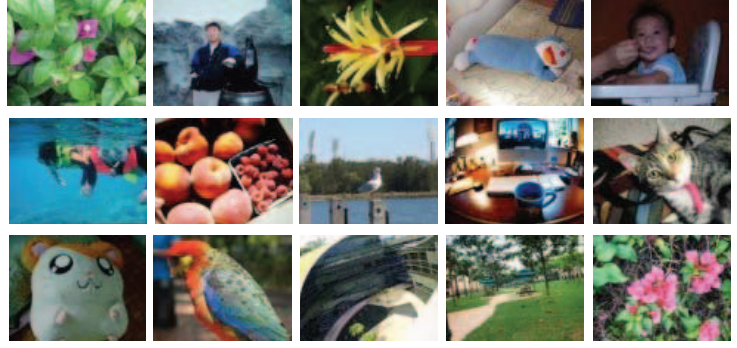
Fig. 5 Samples of 50 Images Used in Human Recaptured Image Identification Survey

Local binary pattern (LBP): Texture patterns at fine scale are often easily observable on a poor-quality recaptured image. Formation of these textures is due to the aggregation of the regular tiny structures appearing on surface of a LCD, the unique polarity inverse driving pattern [11] and the periodic recharging of the CMOS capacitors, which affect brightness of the tiny LCD cells. Though these texture patterns are not obvious in our finely recaptured image, we consider complete elimination of the textures is very