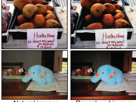
Fig. 4 Two pairs of Training Samples of Nature and Recaptured Images

participant can closely examine the image differences caused by the recapturing. After about 2 to 5 minutes' training and when the participant felt confident, we let the participant to browse through 50 selected photos as shown in Fig. 5, which contain 20 natural photos and 30 recaptured photos mixed in random order. The participants are allowed to take their own time to closely examine each image before they classify the image either into the "natural" category or the "recaptured" category. This survey is conducted on 30 participants, who are mostly university students and staffs. By comparing the participants' answers with the ground-truth answers, we find on average, the type-I error rate is 19.8%, i.e. natural images been misclassified as "recaptured" and the type-II error rate is 51.1%, i.e. the recaptured images been misclassified as "natural". The standard deviations of the type-I error rate and type-II error rate are respectively 12.8% and 18.3%. These large error rates suggest that common people are poor in differentiating the finely recaptured photos from natural photos. Therefore, these recaptured images can potentially fool both human eyes and the current image forensic system.